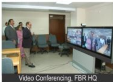
Video Conferencing, FBR HQ

FBR inaugurated two new facilities this year: a new state-of-the-art Data-Center and a new Video Conference facility. Both facilities are located at FBR Headquarters and connected to regional offices.