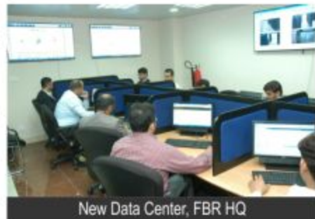
New Data Center, FBR HQ

There are 29 video conferencing points at major tax offices across the country. The new facilities will increase the effectiveness of the FBR. If FBR can improve the video-conference facility to make it accessible from office PCs, it will improve work at incredible pace.